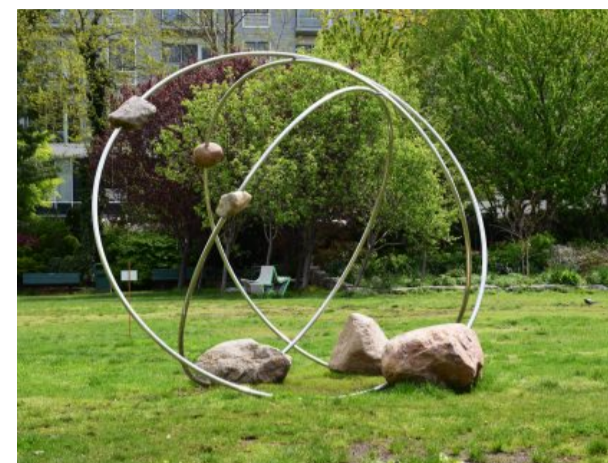
Sculpture Parks and Gardens To Visit