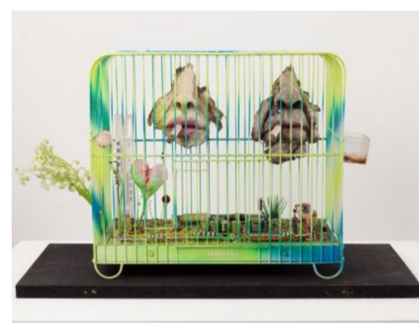
Tetsumi Kudo: Cultivation