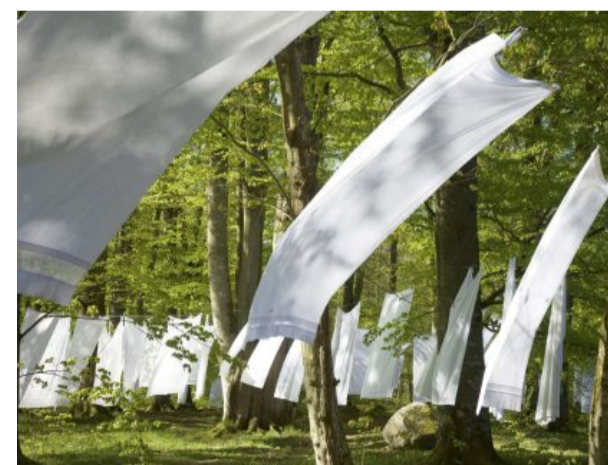
Kimsooja: Sowing Into Painting