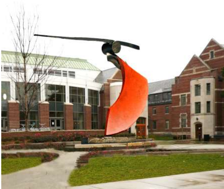
artist's digital projection of site

All successful public art operates on more than one level. First, it must have a compelling visual presence that catches and impresses the eye. Next it must make some connection to the viewer's world or experiences in order to resonate. Last, it must present ideas or concepts that intellectually challenge and engage. I believe this project does all.