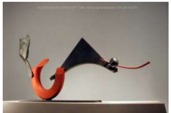
examples of past related works