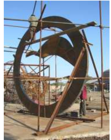
recent Olympic installation- Beijing 2008

Installation - will be contracted to a professional sculpture installation company familiar with my work to insure the most efficient, safe and least disruptive situation.