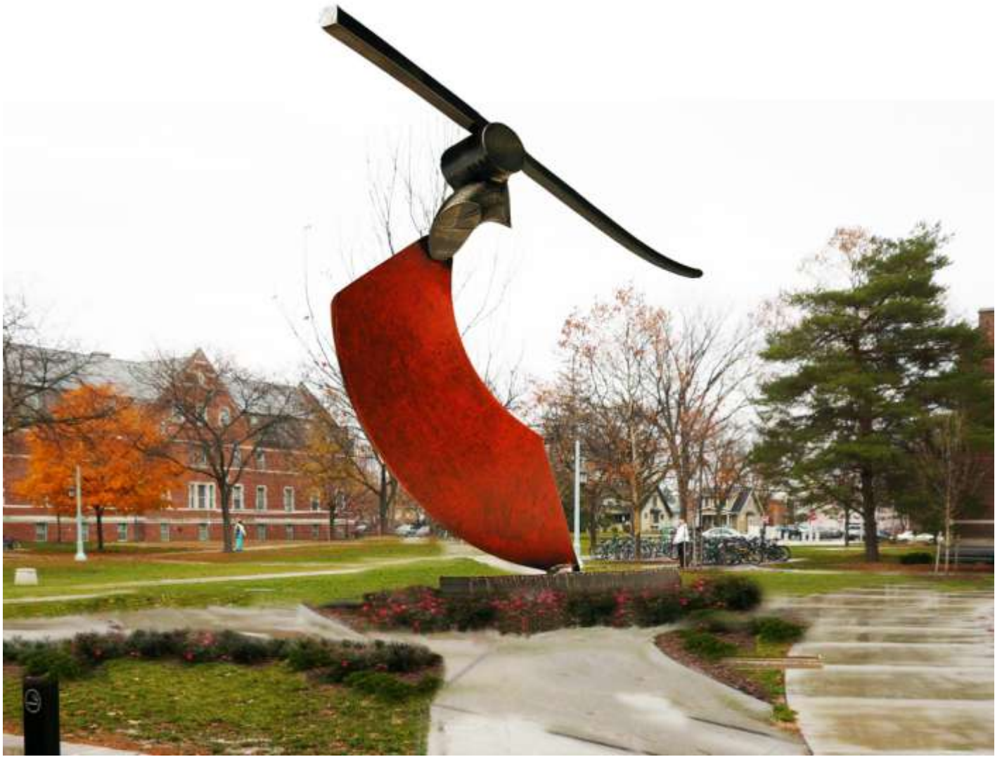
artist's digital projection of site