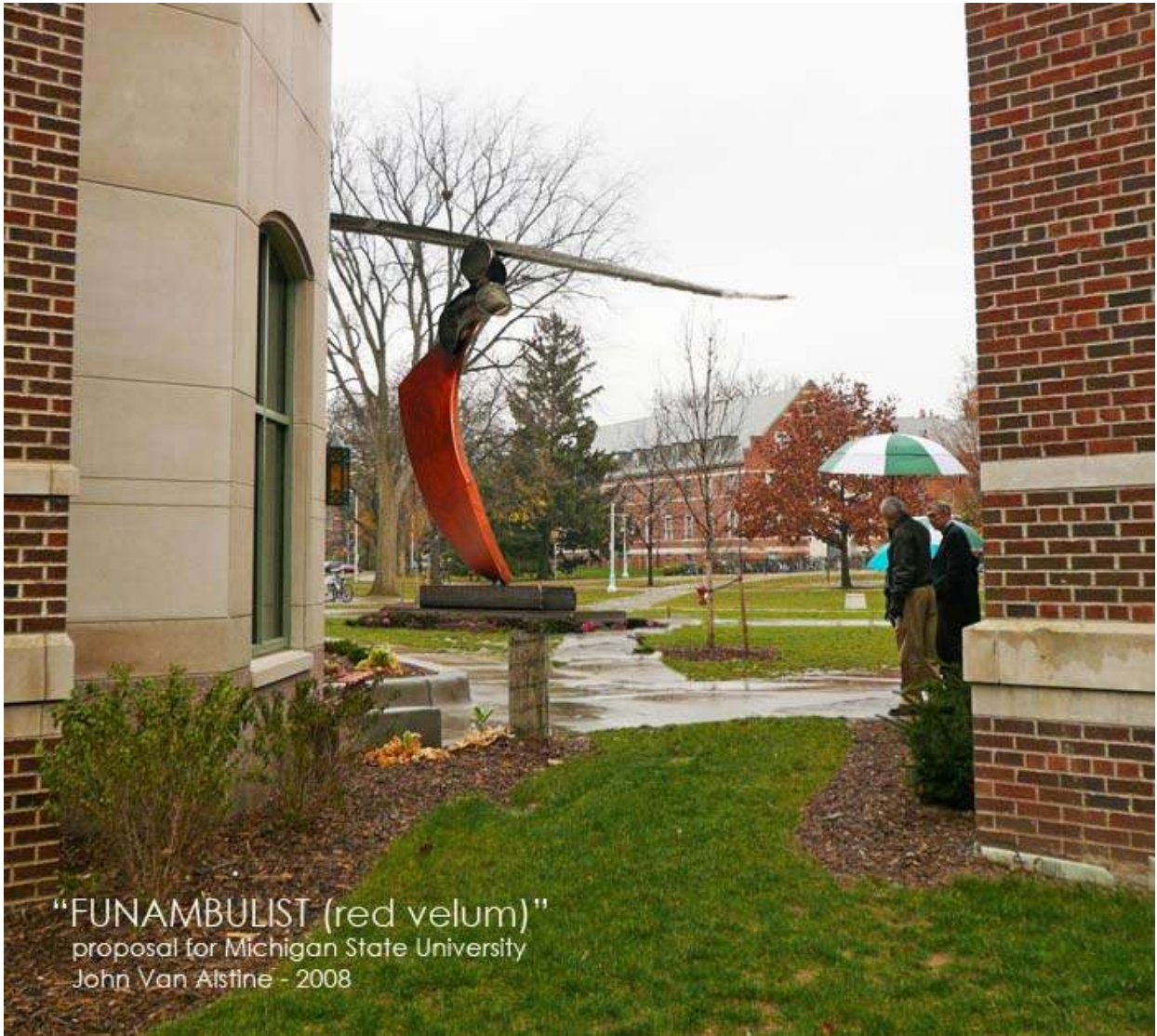
artist's digital projection of site