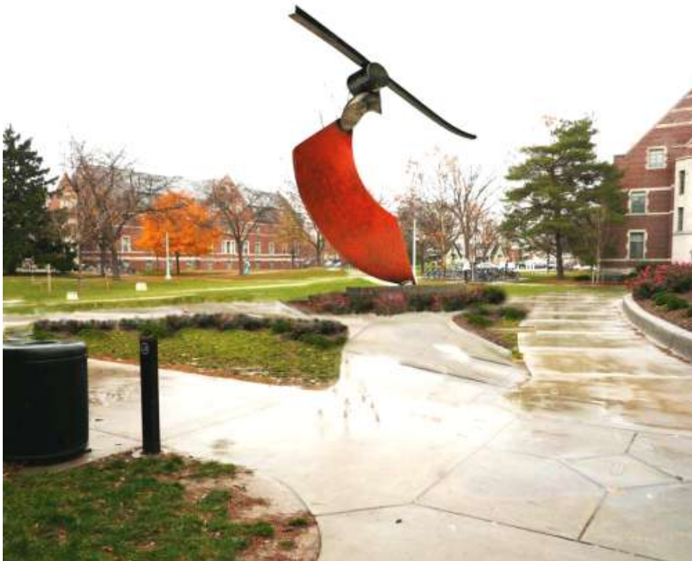
artist's digital projection of site