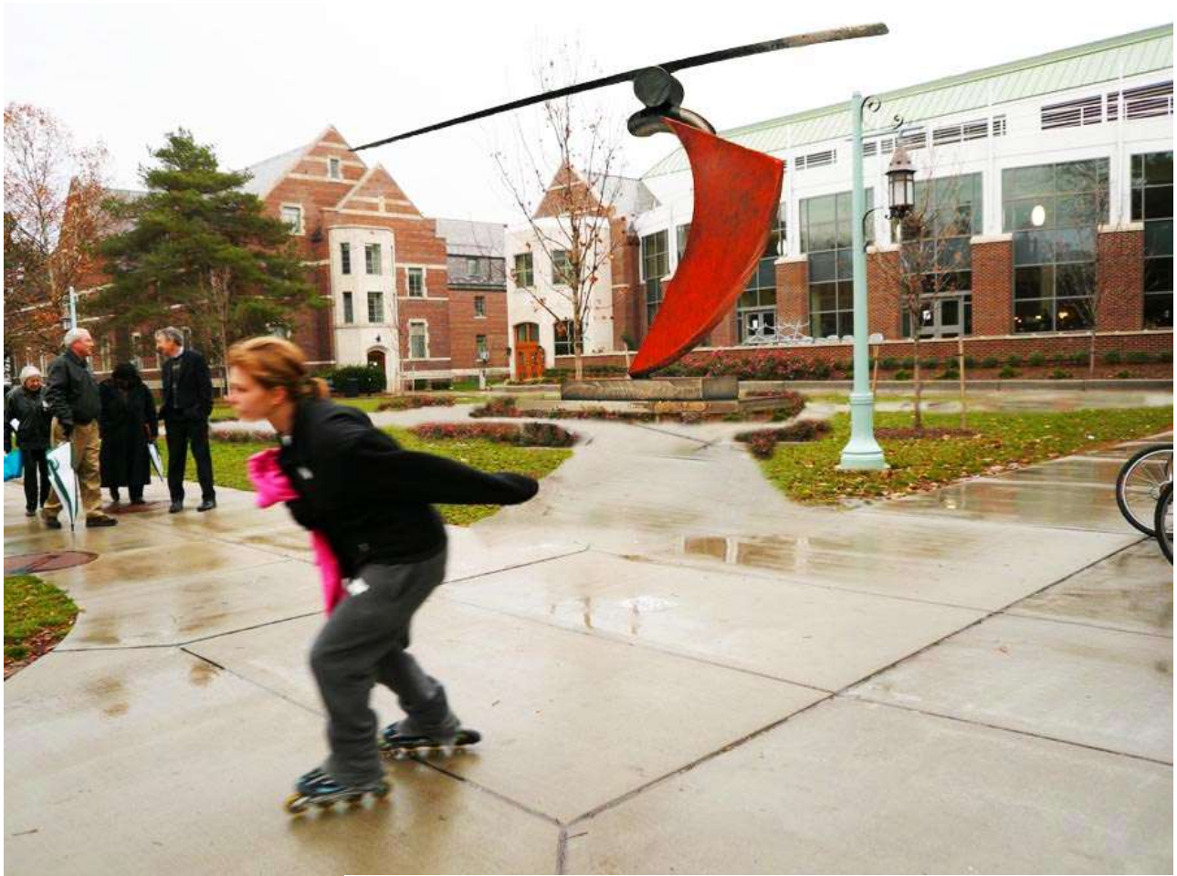
artist's digital projection of site

It is the precisely the union of these concepts; the formal and conceptual , that creates an appropriate metaphor for MSU student and college students in general as they perform their precious and daring balancing act and navigate through this very important and formative time in their lives.