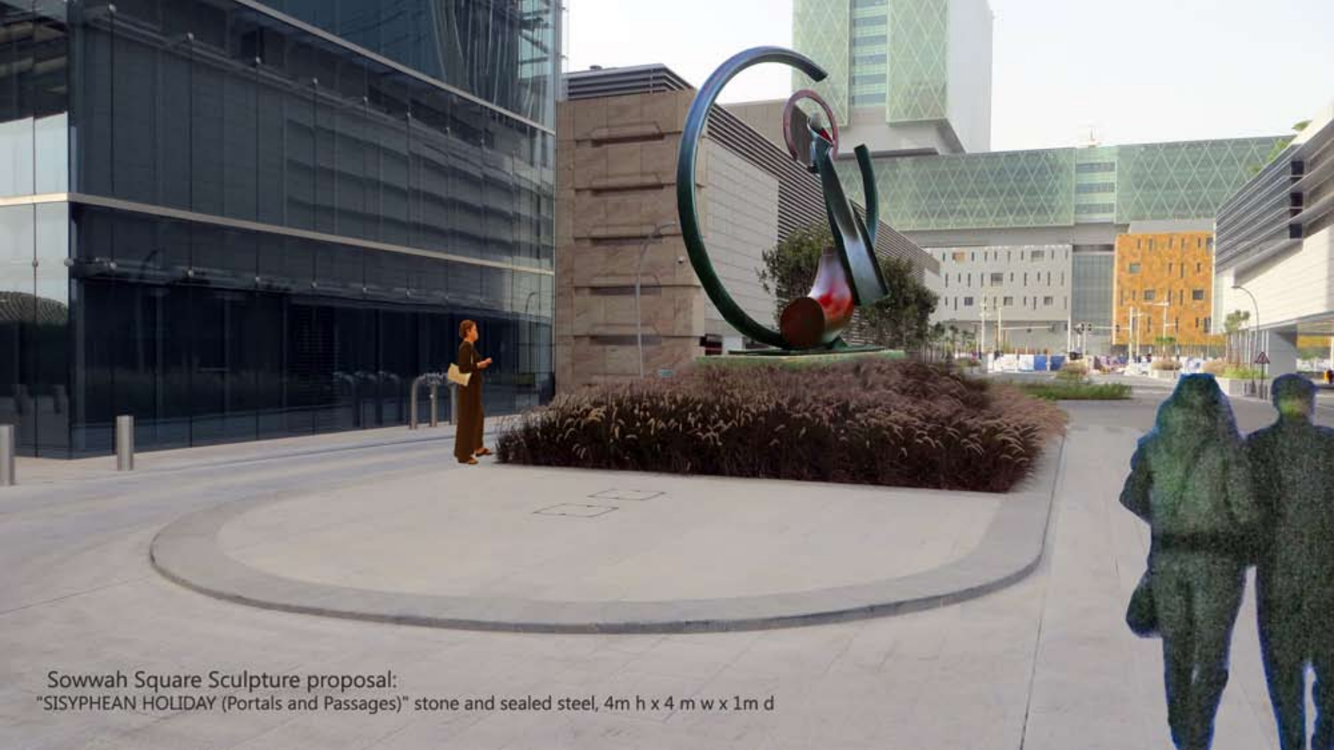
Sowwah Square Sculpture proposal: "SISYPHEAN HOLIDAY (Portals and Passages)" stone and sealed steel, 4m h x 4 m w x 1m d